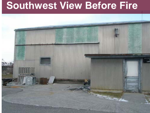
Southwest View Before Fire