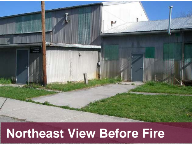
Northeast View Before Fire