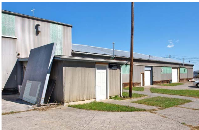
Southwest View Before Fire