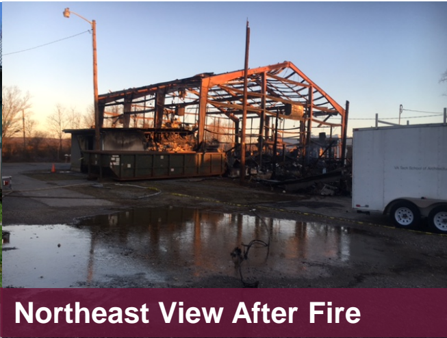
Northeast View After Fire