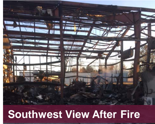
Southwest View After Fire