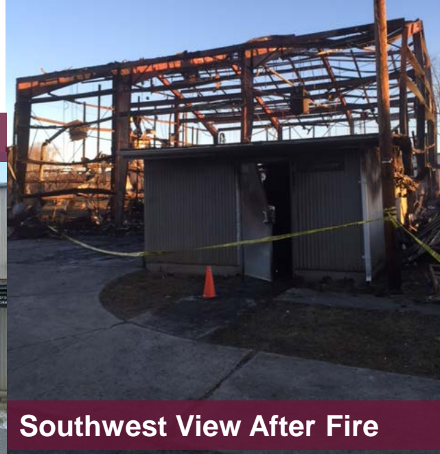
Southwest View After Fire