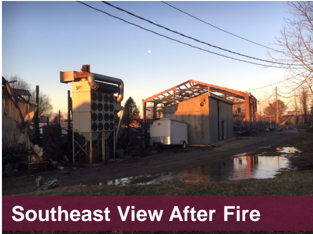
Southeast View After Fire